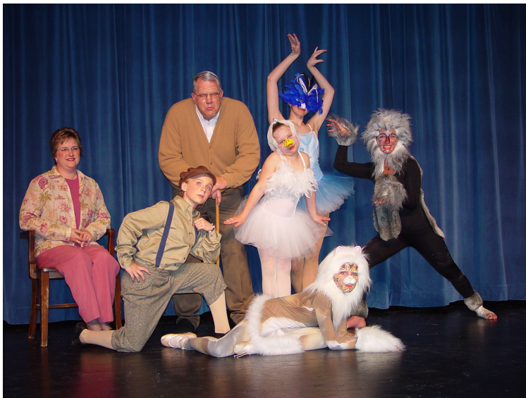
Cast of Peter and the Wolf .

Visit peacepipeplayers.org for more details.