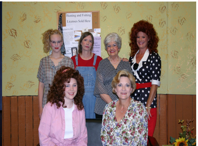
Cast of Steel Magnolias